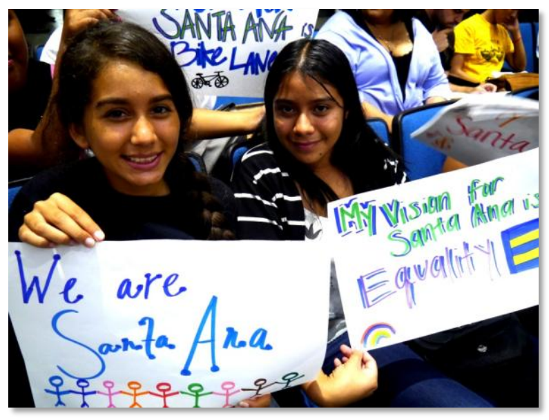
Santa Ana Youth and Residents at City Council Meeting