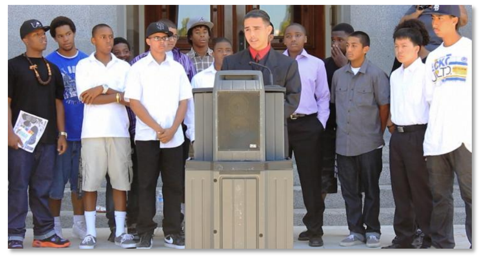
Sacramento BHC Youth at Gabriel Brower Rally, 2011