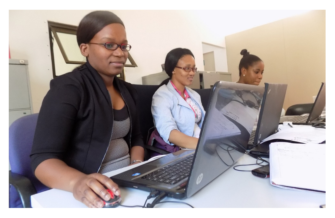
Young people participating in a training program at the Mentec Foundation.

to the intern—at which point the responsibility for remuneration would also shift to the employer.