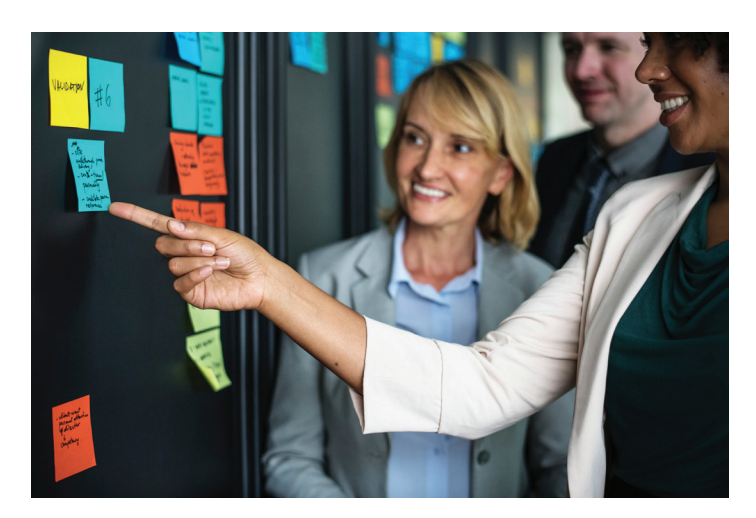
Appreciative Inquiry explores, identifies, and further develops strengths in order to envision and create a better future.