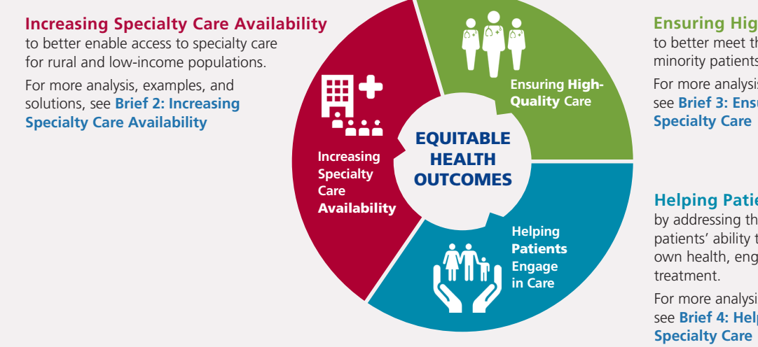
Figure 1. Overview of Other Briefs in This Series Detail on following page

While there is growing evidence that these solutions are effective, supportive institutional leadership and the right enabling environment remain essential to adopting these solutions sustainably and at scale. This brief will highlight the key factors that consistently enable successful adoption of health equity solutions and the resulting implications for key actors in the health system.